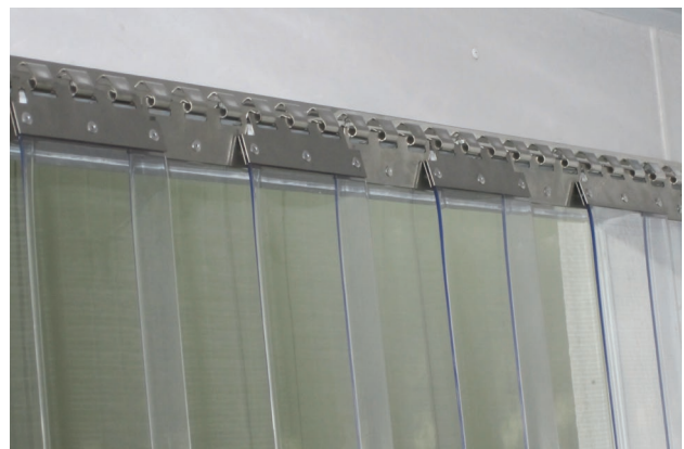
HOOK ON / HOOK OFF HEAD SECTION