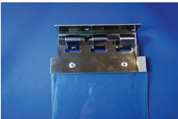
HOOK ON HOOK OFF PLATES