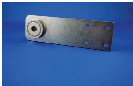
HOLD OPEN MAGNET