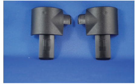
LEFT/RIGHT HINGE COVERS