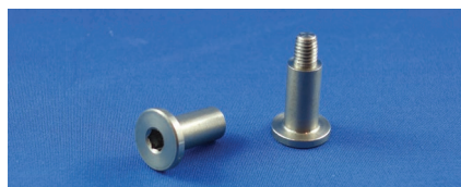
TEE NUTS (MALE & FEMALE)