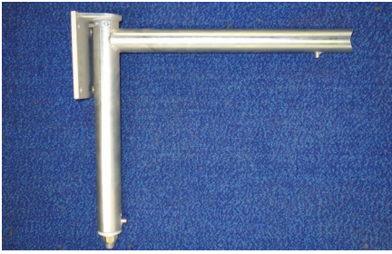
TOP HINGE MOUNT SIDE FIX