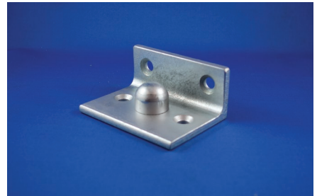
BOTTOM PIVOT MOUNT