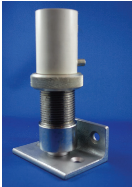
COMPLETE BOTTOM PIVOT