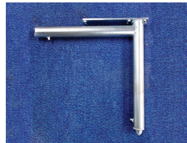
Lintel mount spring