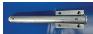
Side mount spring

These Aluminium Flexible "See-Thru" P.V.C. Swing Doors are suitable for food manufacturing plants, hospitals, supermarkets, meat works and specialty retail stores.