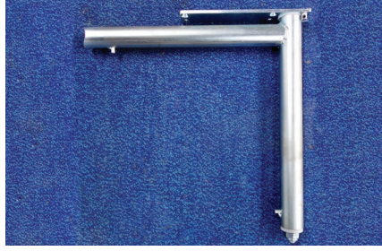
TOP LINTEL MOUNT SPRING