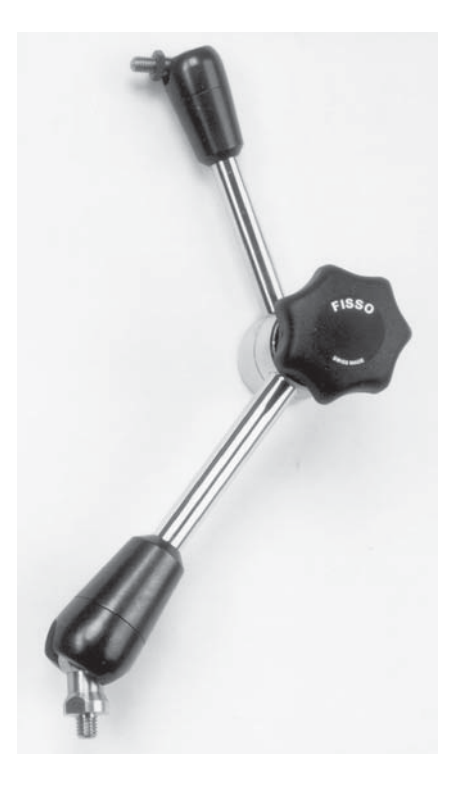
SMALL FISSOFLEX - ARM ONLY Arm - 1000